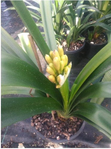
Left: EUROPEAN PEACH.