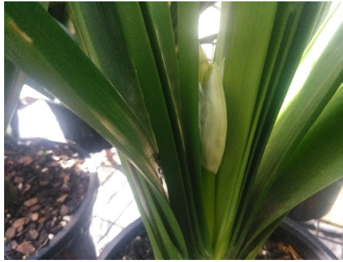
Centre: Group One Peach.