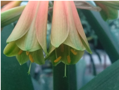
Left: Harburg Blush X Hottie Hirao