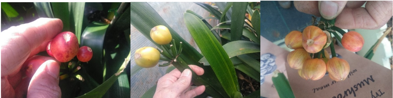
Left: Speckled EUROPEAN PEACH. Right: Striped EUROPEAN PEACH, both flowered pink edged peach in 2019

Just goes to demonstrate that the berry colour does not always indicate the flower colour. In the case of the left-hand berry above, the dominant berry skin pigment appears to be pelargonidin-3-rutinic acid or scarlet. If you dilute scarlet you end up with a soft baby pink. Interesting!