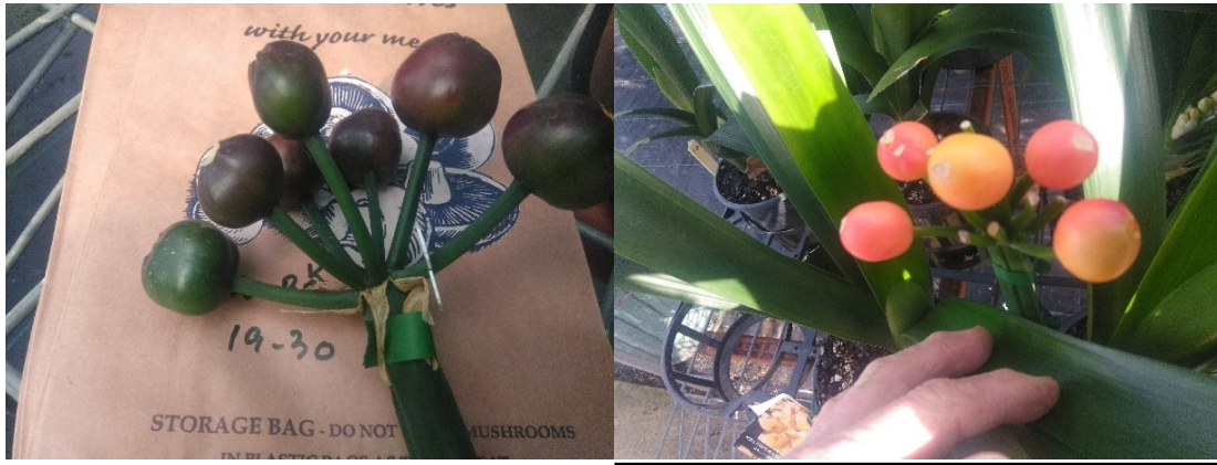
Both are EUROPEAN PEACH – left flowered pink and right flowered peach in 2019

Just goes to demonstrate that the berry colour does not always indicate the flower colour. In the case of the left-hand berry above, the dominant berry skin pigment appears to be pelargonidin-3-rutinic acid or scarlet. If you dilute scarlet you end up with a soft baby pink. Interesting!